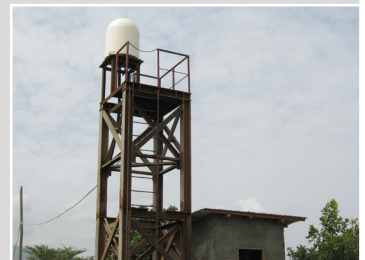
Examples of installations